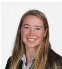
Imigen Langford House Cross Country