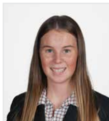
Sophie Hollyoak House Swimming Bass Values