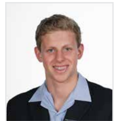
Bowen Gough House Swimming