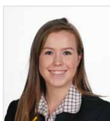
Genevieve Stead House Athletics Clarke Values